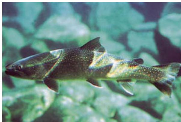
Bull trout inhabit only one river system in Nevada.

Hunt emphasized that the settlement agreement does not transfer any controlling interest in the land to Elko County.