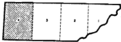
KEY TO SHEET NUMBERS